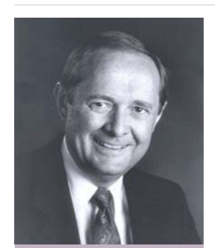
President Turbo Leadership Systems

Engaging leaders see frustration as motivation