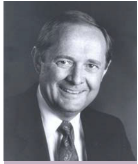
President Turbo Leadership Systems

Engaging Lead ers communicate during uncomfortable situations.