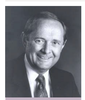
President Turbo Leadership Systems