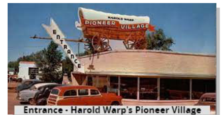
Entrance - Harold Warp's Pioneer Village

TO SHOW OUR CHILDREN HOW THIS GREAT COUNTRY WAS BUILT. WARP DECIDED IT WAS TIME FOR SOMEONE TO PRESERVE THESE EVERYDAY ITEMS IN THEIR ORDER OF DEVELOPMENT, WHILE STILL AVAILABLE, SO FUTURE GENERATIONS COULD SEE THE HISTORICAL DEVELOPMENT OF OUR GREAT COUNTRY.