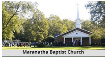
Maranatha Baptist Church

I was amazed that there was no one in the house, watching us as we went through to make sure nothing was disturbed. Good to know that tourists in South Georgia can still be trusted.